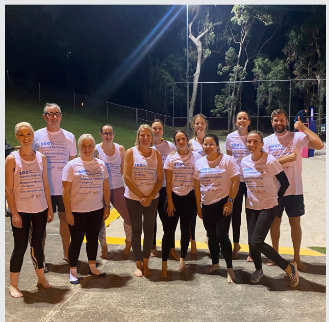
Elevate Residential and BHC supporting Yourtown Australia's Beach Volleyball Fundraiser

We are always looking to partner with organisations for events that align with our values. If you have any sponsorship opportunities or would like to work with us on an event or opportunity, please contact our team to discuss how we can work together.